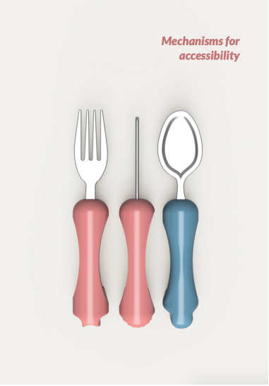
Pamplona, 25 de noviembre 2020