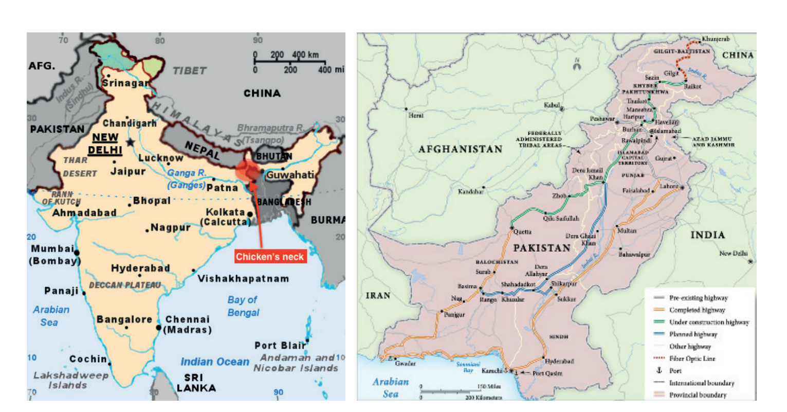
Indian "Chicken's Neck" and the project for the China-Pakistan Economic Corridor [Wikipedia and the CPEC website]

states and the larger Indo-Pacific. The idea behind the division is to look at countries from Thailand to the Pacific islands as belonging to one region. The division will be headed by an Additional Secretary ranked officer. This is also an indication of the importance of the Indo-Pacific. In November 2019, India has also proposed an Indo-Pacific Oceans Initiative (Saha, Mishra, 2020). This initiative is intended to ensure a safe. secure and stable maritime domain. The focus areas include creating partnerships among interested states in enhancing maritime security; sustainably using marine resources; disaster prevention & management.