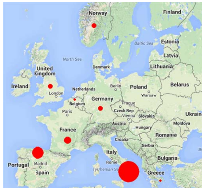
Figure 2. European countries as the test beds for empirical analyses

Notes. A further article that addresses the entire European Union is not depicted in the figure.