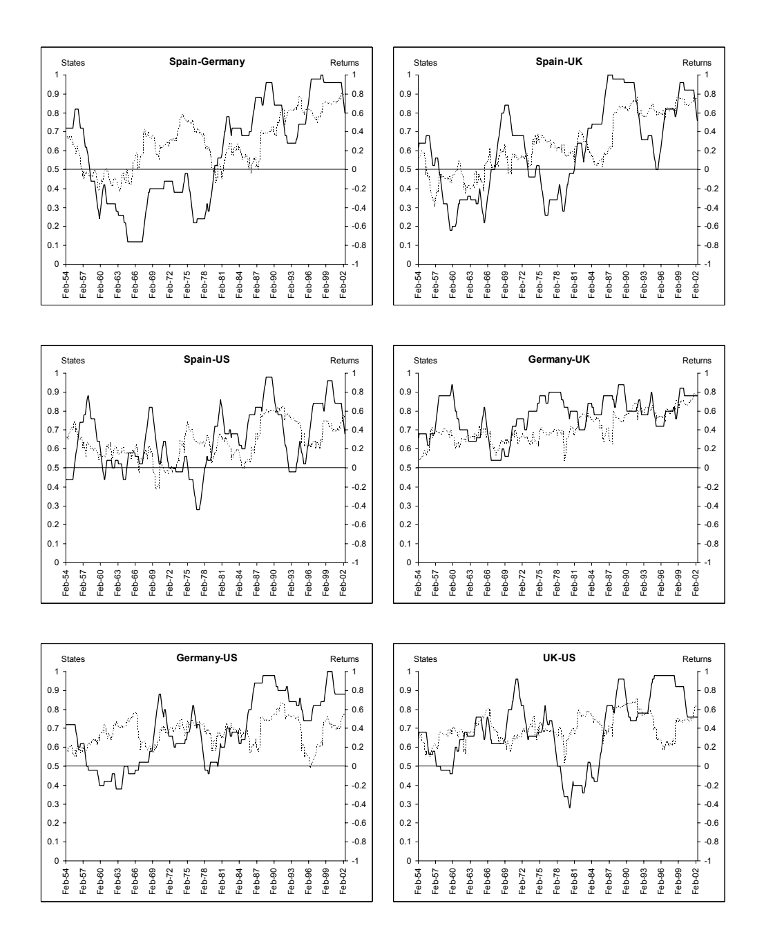
Figure 3: Evolution of market synchronicity in Spain, Germany, the UK and the US: Comparison of rolling correlation indexes of simple returns (dashed line) and rolling concordance indexes of bull/bear states (solid line). The rolling window has size 50.